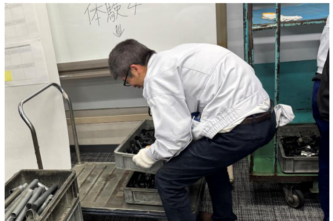
Wearing a “Perionoid” and lifting heavy objects from a cart. Pain prevents him from standing up straight and he has no strength in his arms.