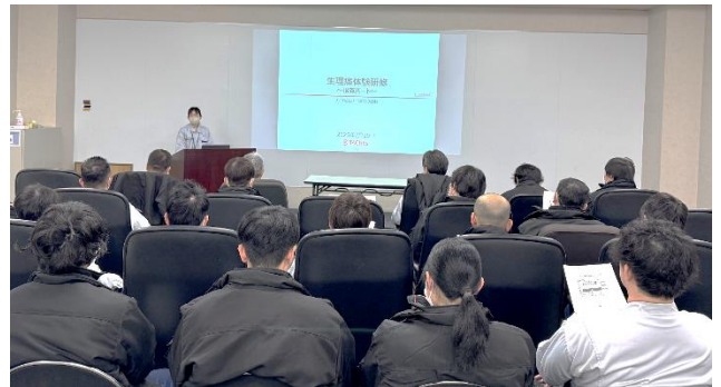
Seminar on basic knowledge of menstruation