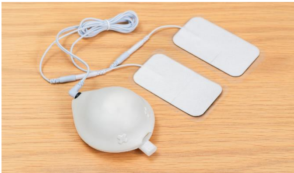
Period pain experience device “Perionoid”

The training was part of TACHI-S's “People-Friendly Factory Creation Activities,” a series of activities that TACHI-S has been undertaking since the current fiscal year with the aim of realizing manufacturing that is open to all and creating workplaces where employees can work comfortably. The training was attended by 24 participants, including the plant manager and other managers, and included a seminar on basic knowledge such as the mechanism of menstruation, a simulated menstrual pain experience, and a workshop based on this experience. The simulated experience included tightening screws and bolts, lifting heavy objects from a cart, etc., using the “Perionoid,” a device for experiencing menstrual pain with the cooperation of Linkage, Inc. Participants commented that they could not concentrate on their work if they had pain while working, and that it was difficult to exert effort when lifting heavy objects. The event provided an opportunity for each employee to think about creating a workplace environment where it is easy to discuss menstrual pain and concerns, and to consider how to treat and care for those in different positions.