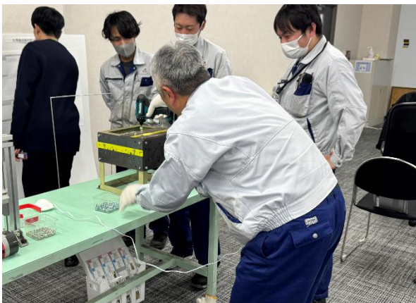
Wearing the “Perionoid” and tightening screws or bolts. He is unable to maintain correct posture and concentration.